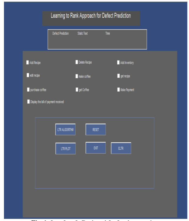
Fig. 1: Interface Is Designed for Implementation.

As shown in figure 1, the interface is designed for the implementation of Learn-to-rank and improved rank-learn algorithm. Ten test cases are shown within the interface. Here the existing and proposed algorithms are executed. The result is analyzed in terms of the parameter of fault detection rate.