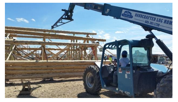
Fig. 3: Realization of log construction [35].

The characteristics of log construction system are: High craftsmanship, special selection of wood, high wood consumption, solid ground plan, volume and shape changes of the building, building siting (Fig.3,Fig.4). Rough construction creates a unique atmosphere with its architectural expression and provides full use of wood as a natural material (material cleanliness). Compared to lightweight skeletal structures they provide higher thermal accumulation capability. This property positively affects the overall energy balance of the log structure. From the point of view of the environment and the energy load it is beneficial to use so-called false log cabins that use only locally available renewable materials where wood is not chemically protected, with the least possible natural-dry treatment. By using alternative (natural) thermal insulation such as sheep's wool, hemp, it is possible to minimize the associated energy, in the energy required to operate with a reduction in CO<sub>2</sub> emissions.