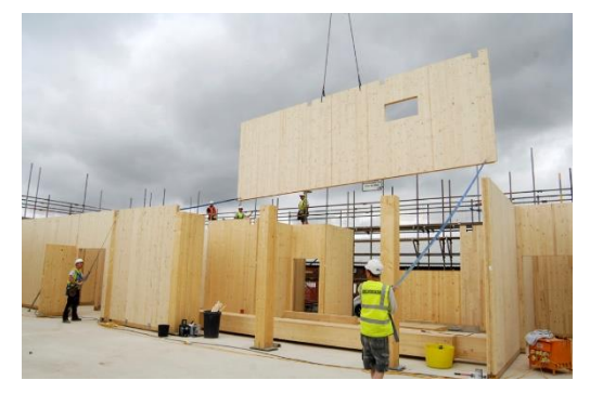
Fig. 2: Example of panel construction system [34].