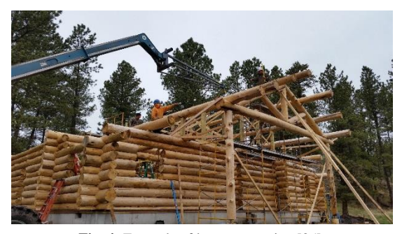
Fig. 4: Example of log construction [35].