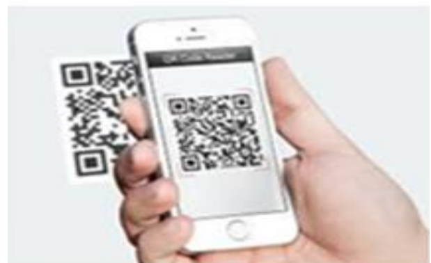
Fig. 3: QR Code Scanning.

Exam interface will display the questions. After completed the exam student's click on finish to display the exam mark instantly in their application. Simultaneously students mark will be send to their log management.