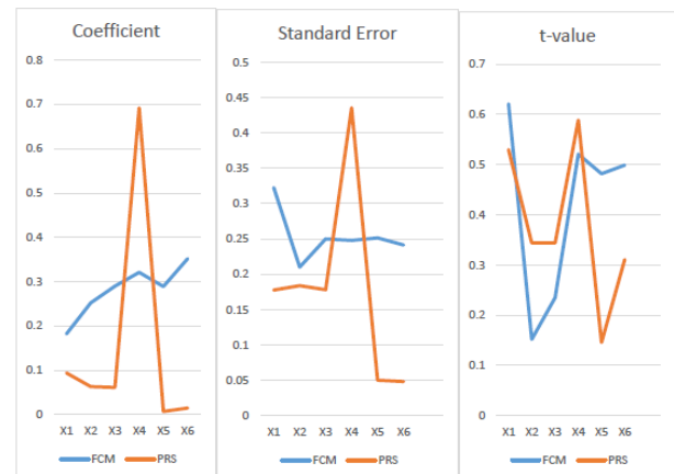
Fig. 1: Integrated Graph for FCM and SSC Methods.