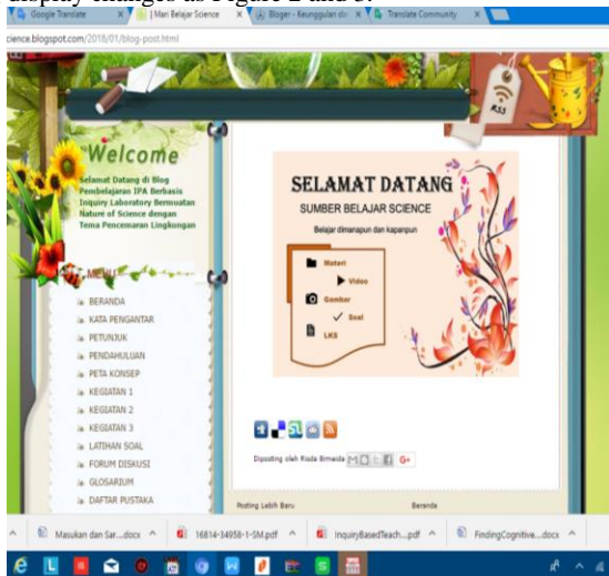
Fig 2: View Blog Home Image after Revision

Blogs developed then validated to material and media experts. Based on the validation of media and material experts, qualitative results obtained about blog improvements that include the display of blog pages should reflect the topic, re-review for the order of post menu in the blog so that more systematic, and the inclusion of learning objectives, and settings in the comment field only active on the menu discussion forums so that incoming comments are focused on the discussion forum menu. Furthermore, blogs are improved as suggested by material and media experts. As for the blog display changes as Figure 2 and 3.