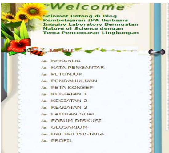
Fig 3: Blog Page Menu after Revision

The blog as a media interactive is use by blended learning in NOS within inquiry laboratory model. Students can access the science material of learning by using blog and can download the student